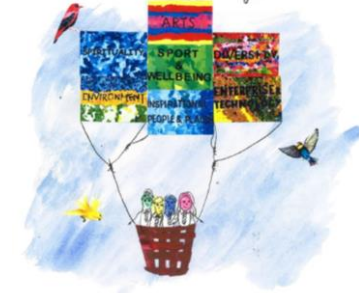
Take a good look at God's wonders- they'll take your breath away" psalm 124

We help everyone develop their whole self through Head Heart Hands Head ♥ Mental health and learning Heart ♥ Spirituality and relationships Hands ♥ Physical health