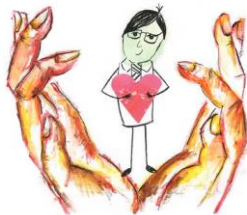
"You are God's masterpiece." EPHESIANS 2:10

We help everyone develop their whole self through Head Heart Hands Head ♥ Mental health and learning Heart ♥ Spirituality and relationships Hands ♥ Physical health