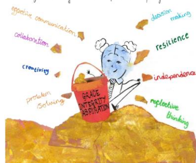
"I can do all things through Christ who strengthens me" PHILIPPIANS 4:13